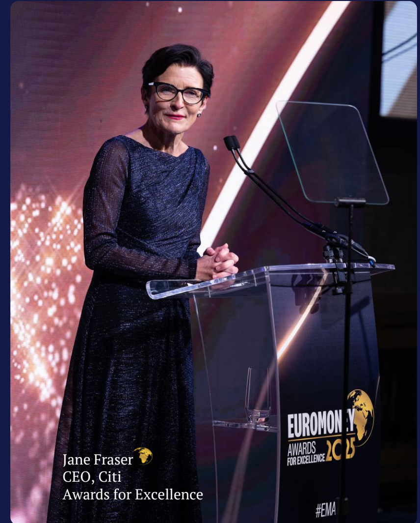
Jane Fraser CEO, Citi Awards for Excellence